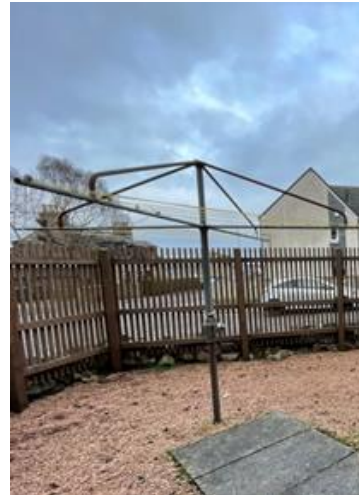
Exterior – Washing line