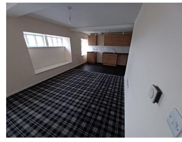
Open plan living room/kitchen area