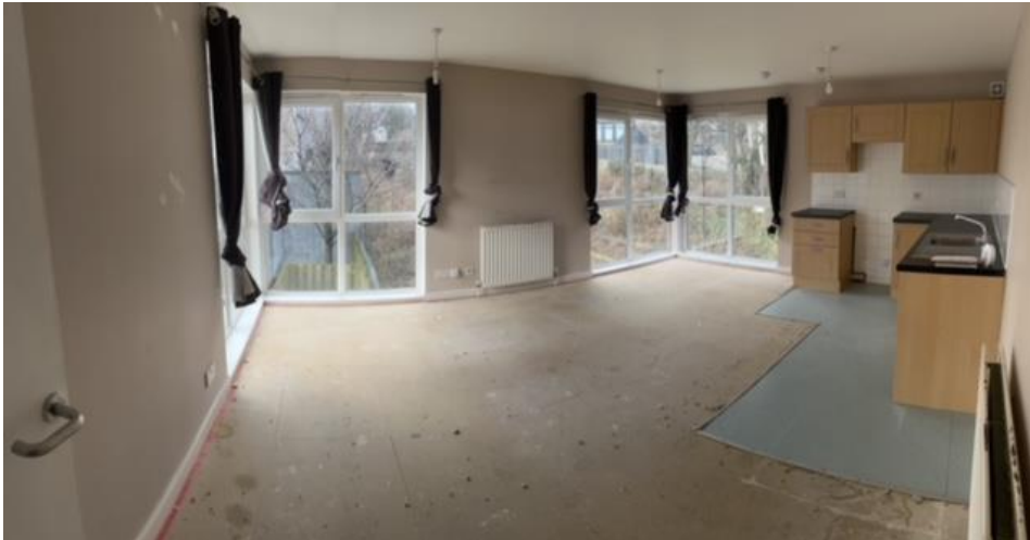
Open living room / Kitchen area